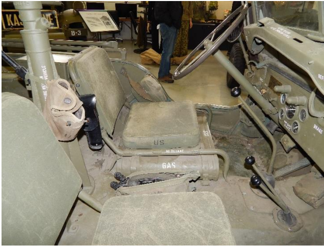
Sitting on the gas tank.