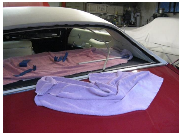
“Found the Leak!!!!”