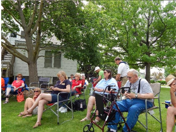
Sitting in the sun at the start of the meeting