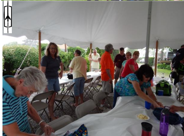
Holding down the tent and tablecloths