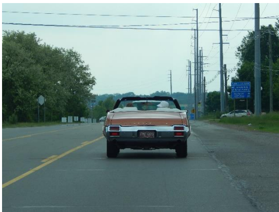
The cruise to Dust Off

All in all, it was good friends, good food and some beautiful, if not wet, cars. Good day in my book. (Editor's note here, I do have to laugh a bit when I think of these driver's and their cars. I have literally seen them drive into oncoming traffic just to avoid a little water in the road and yet not one complained that their cars were drenched by the end of the day. You were ALL troopers!)