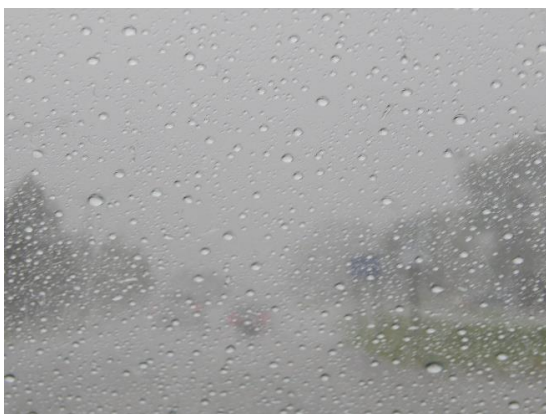
The cruise home