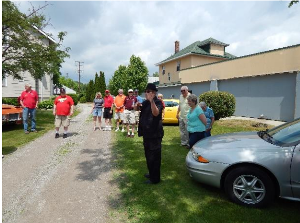
The blessing of the cars