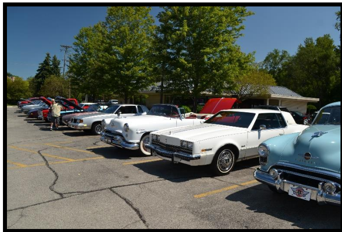
Love those Oldsmobiles!