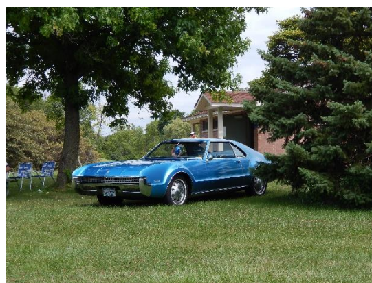
Hidden treasures –