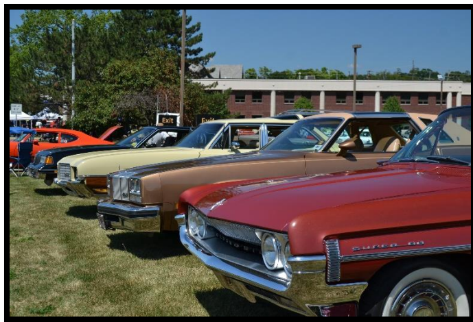
What a bunch of beauties