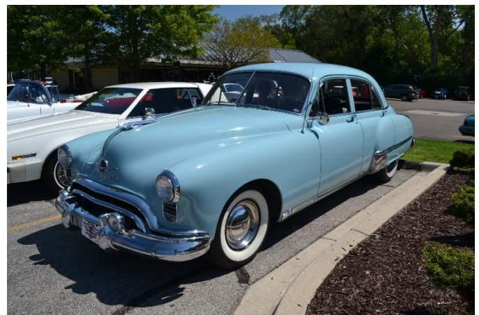
"Arty" at Woodward Dream Cruise