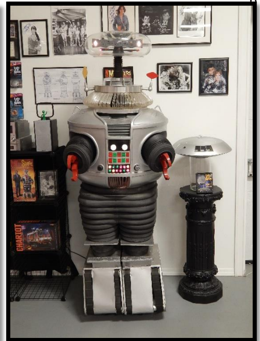
'Lost in Space'