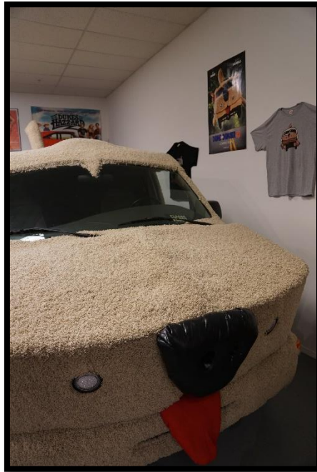
'Dumb and Dumber'