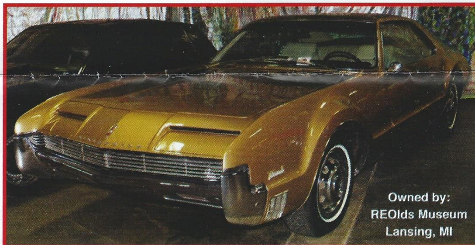
Owned by: REOlds Museum Lansing, MI

Follow Site Direction Signs to Showfield, Trailer & Spectator Parking